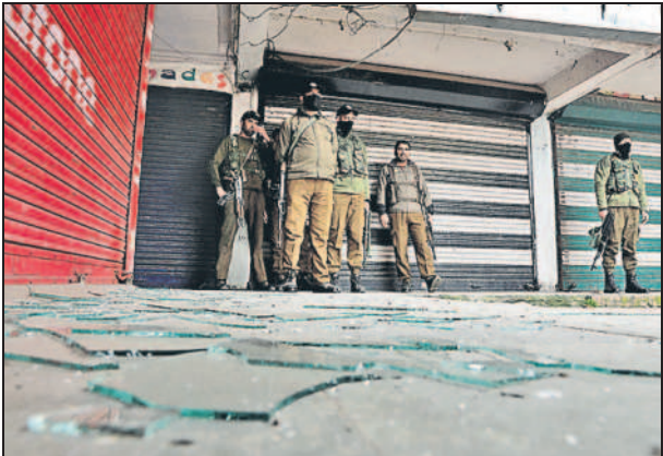
Policemen keep a vigil around the site near Kashmir University, where a low-intensity blast also took place.

This is the first big government outreach since the state was bifurcated into two Union Territories - J&K and Ladakh -- on August 5.