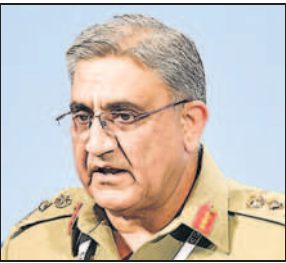
General Qamar Javed Bajwa

The second phase of the "back to village" programme was launched by the Union Territory administration this week after the first Lt Governor of Jammu & Kashmir, GC Murmu, said 5,000 officers will reach out to the people in each panchayat.